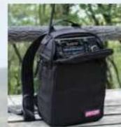
LC-192 Multi-function backpack

The IC-705 fits perfectly in the optional dedicated LC-192 multi-function backpack. It has various functions, such as holes for the antenna and holes for passing through coaxial cable and microphone cable. You can easily operate the IC-705 with it in the backpack.